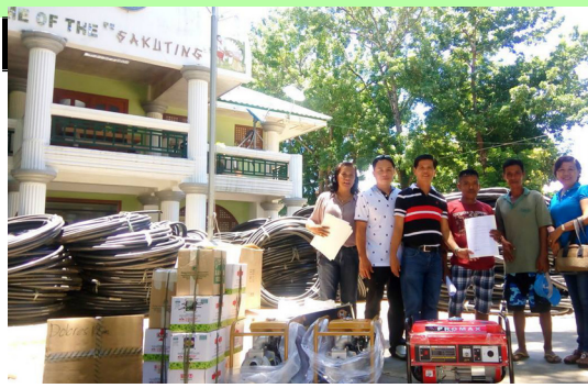
Distribution of water pumps and pipes for irrigation