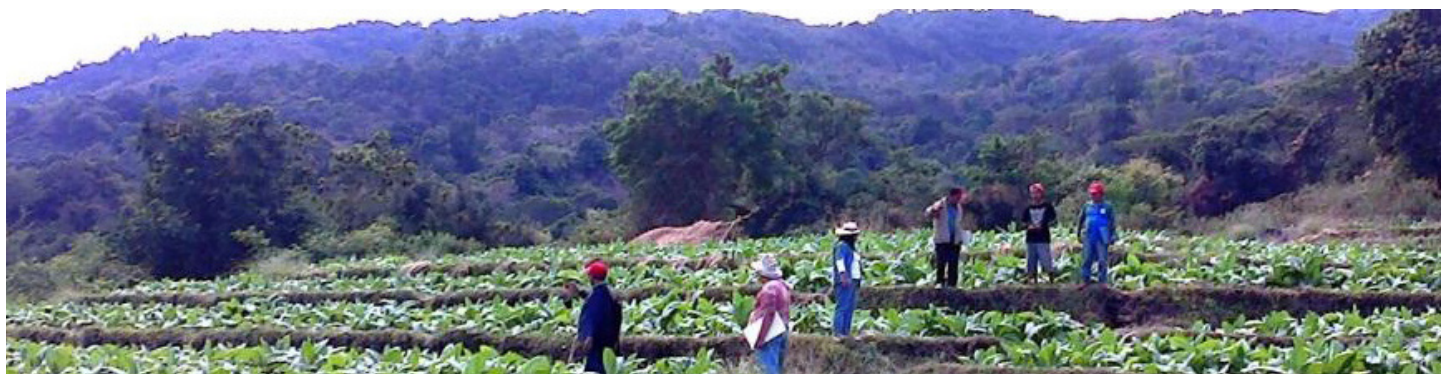
TCGS monitoring by the Branch officials at a farm in Pidigan

A BRA Branch is one of the smallest branch offices of NTA. Prior to the 1999 reorganization, its manpower was almost 50 including casual employees. After the reorganization, only 28 employees were left to continue the service to the tobacco farmers. The rationalization further decreased the number of staff to 17, then to 15 due to retirement.