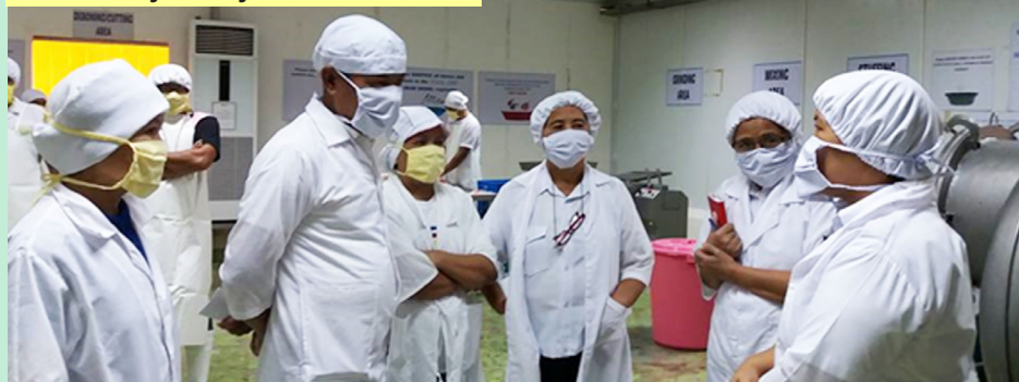
The inspection audit team from FDA Region 1 visits the meat processing section.