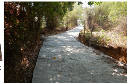
Farm-to-market road in Brgy. Pacac