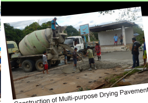
Construction of Multi-purpose Drying Pavement in Brgy. Kimmelaba