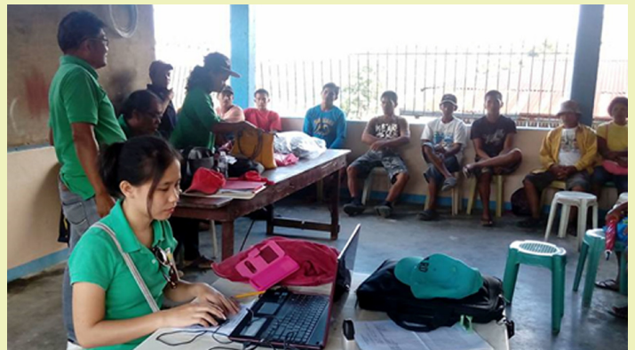
(Left) Farmers' orientation in Labaan, Bucloc, Abra. (Right) Registration of farmers in Lagaosian, Villaviciosa, Abra.