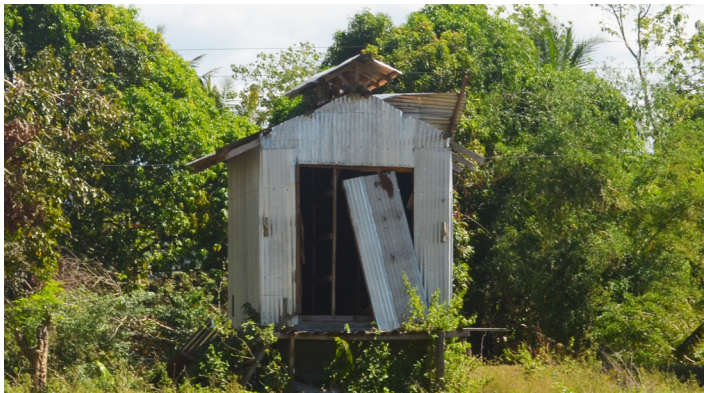
A multi-purpose curing barn damaged by Lawin in Bucay, Abra.