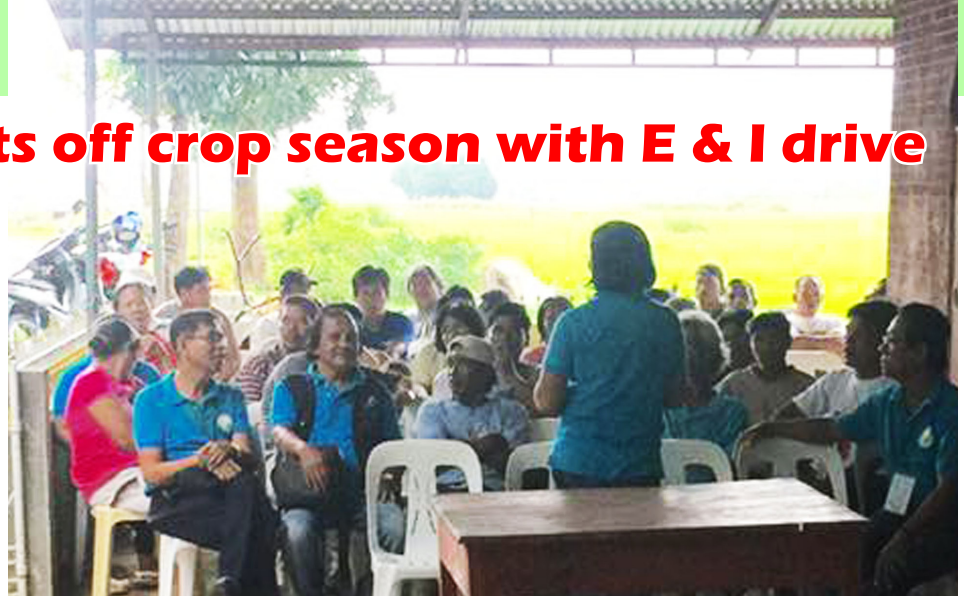
Meeting with farmers in Codoog, Narvacan, Ilocos Sur

The Branch Office brings the “Balik Tabako” program in any of these orientation activities. The program reembraces tobacco farmers who have stopped planting the crop to plant again for another crop year. The local government units in the district support